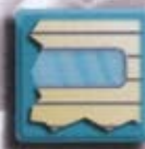
VISION LITES OPTIONAL