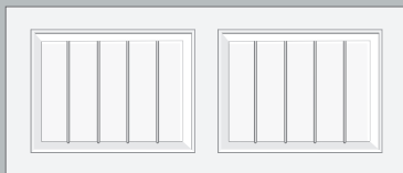
Carriage Style Panel