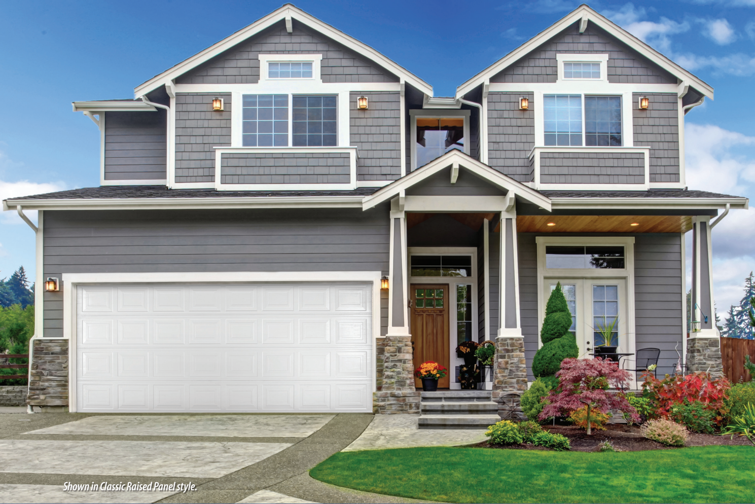
Shown in Classic Raised Panel style.