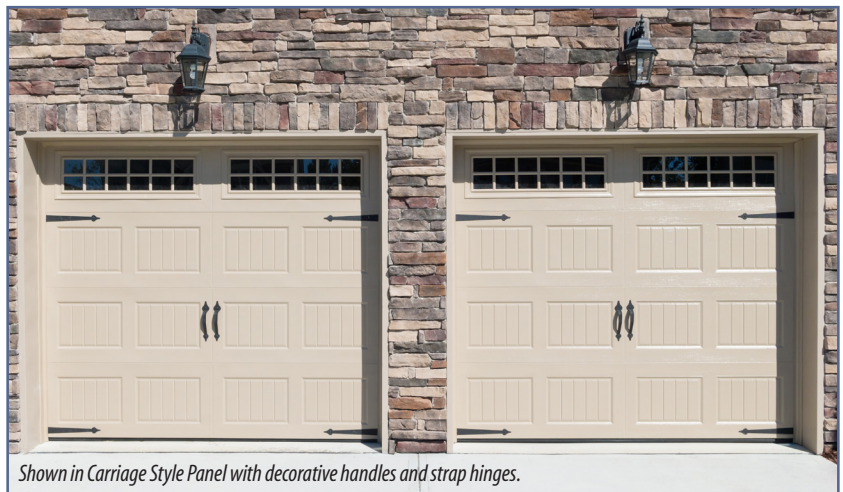
Shown in Carriage Style Panel with decorative handles and strap hinges.

Optional handles, hinges, and window inserts allow you to customize your door.